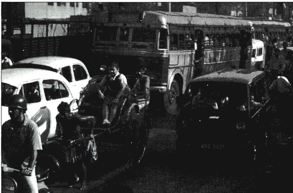
A rickshaw wallah struggles to keep his place amidst heavy early morning traffic.

The vast supply of rickshaw wallahs is consistently fed by an overabundance of poor who eagerly accept this harsh