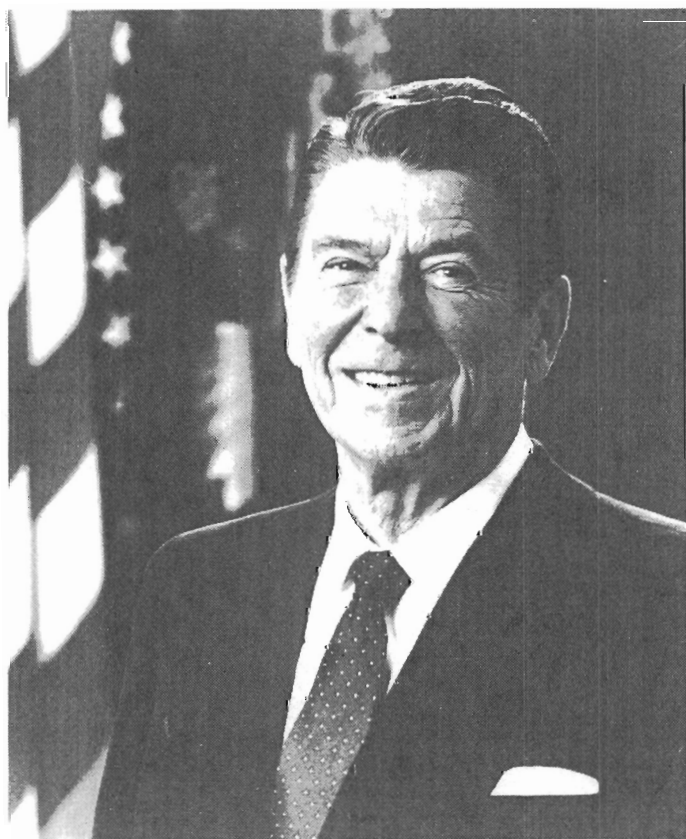
President Ronald Reagan (1981-89): the “dollar weapon” with a twist, a strong dollar.

Historically, even when Germany has gone along with the expansionary macroeconomic platform of the U.S., its effort has been tepid at best. Disagreements between Bonn and Washington over coordinated monetary policy were one factor leading to the October 1987 stock market crash. The Western Europeans, led by the Germans, wanted to avoid the monetary manipulation of the dollar weapon strategy. The Reagan