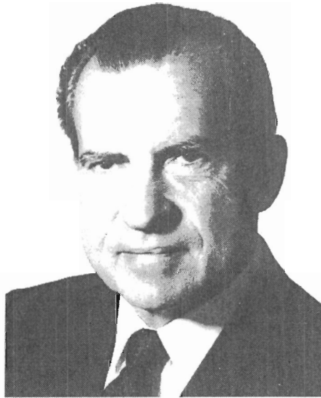
President Nixon (1969-74): closed the "gold window" in 1971.

Insufficient liquidity led to a significant decline in U.S. exports and the recession of 1948-49. Concurrently, and as importantly, Europe and Japan faced political and economic