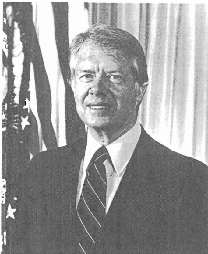
President Jimmy Carter (1977-1981): continued the cheap “dollar weapon” policy.

The dollar remains the world’s center currency. But while