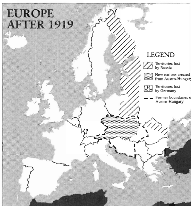
Post-World War I Europe: “nation-states” and “oppressed minorities” . [Electromap, Inc.]

From the outset, the new Italian and German states were met with problems. In a celebrated statement following unification—which belied the nationalist intellectual assumption