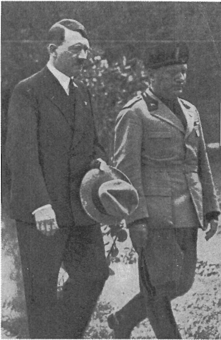
Adolf Hitler: searching for the German nation-state or global domination?

them into their own empires, refusing to admit that colonized people also had the right to self-determination. The Middle East and Africa was divided with little regard for ethnicity, tradition or language.