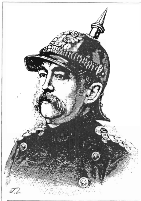
Prussia's Prince Otto von Bismarck (1815-98): unification of Germany from above.

In the old kingdoms, all the functions that we today expect the state to carry out were usually provided by local government. Feudal agricultural estates and towns were the units of production and trade, while nobles and local parliaments made law and administered town affairs. The dynasts' role was to govern relations between these local institutions and communities. In these diverse pockets, political loyalty and sense of shared community went to town, province, guild, or religious body, not state or nation. At the court level, kings surrounded themselves with their own group of loyal servants who were often of foreign descent. One observes Italians serving as diplomats to French and English Kings, as well as Germanic princes on Spanish