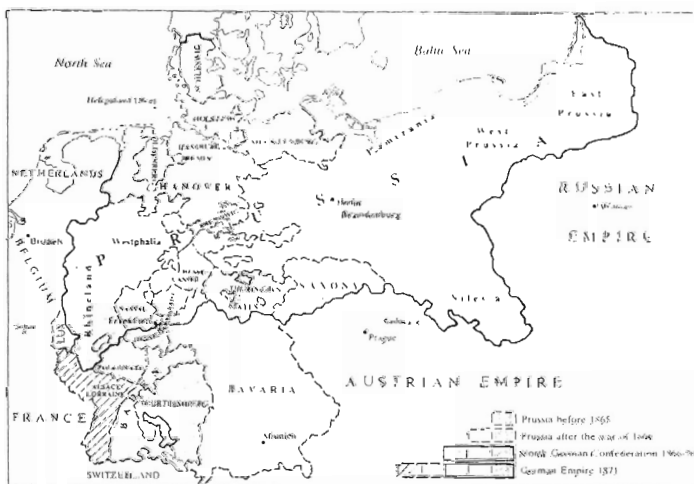
German unification (1866-71): not all Germanic peoples were included. [Robert Gildea, Barricades and Borders , OUP, 1991, p. 199]

The developing force of industrial capitalism also contributed to the coming of nation-states. The pre-conditions of industrial operations involved a steady labor source, supply of raw materials and a market. Changes in agricultural