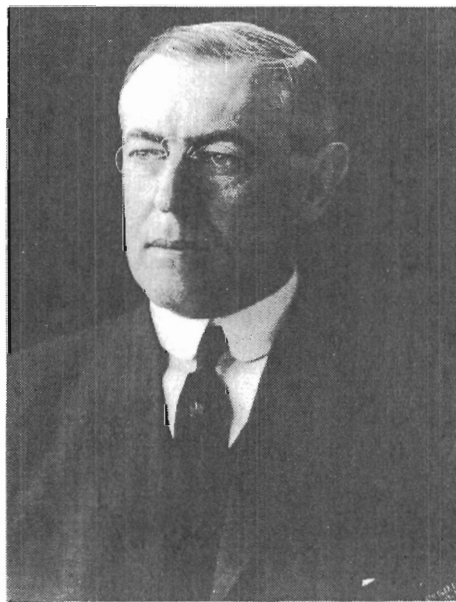
U.S. President Woodrow Wilson (1913-21): staunch supporter of self-determination.

At the same time, Europe simply contained too many overlapping ethnic groups to reach this goal. For example, the new states created from the broken Austro-Hungarian empire were as multinational as the old, only smaller. The previously “oppressed peoples” were now called “oppressed minorities.” Although the Great Powers after World War I championed this principle of minority rights, they confined it to the European continent. The victors of the war divided its spoils, namely the German colonies, and absorbed