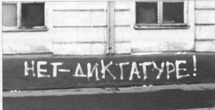
Graffiti writers show their support for reform. "Yeltsin--Yes!" (left) and "No to Dictatorship!" (right)

management, statism, and command administrative system.