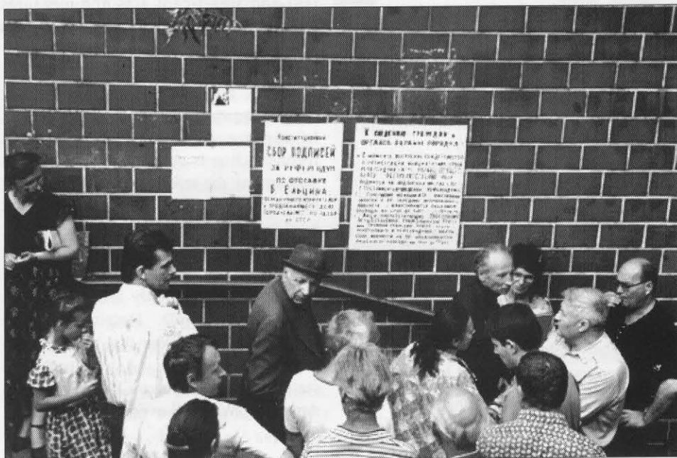
A Moscow crowd considers posters outside a Metro stop telling about Presidential impeachment.

While they support reform, such Yeltsin challengers as Ruslan Khasbulatov and Aleksandr Rutskoi hold different