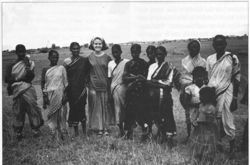
The author with some Joginis and their children. Nizamabad district, India. October, 1992

If economic vulnerability does not first succeed in prompting a family to dedicate their daughter into concubinage, then, in small temple villages, religious superstition often plays a key role in the decision making process. When someone in a village community falls ill, it is not uncommon for a landlord to circulate the