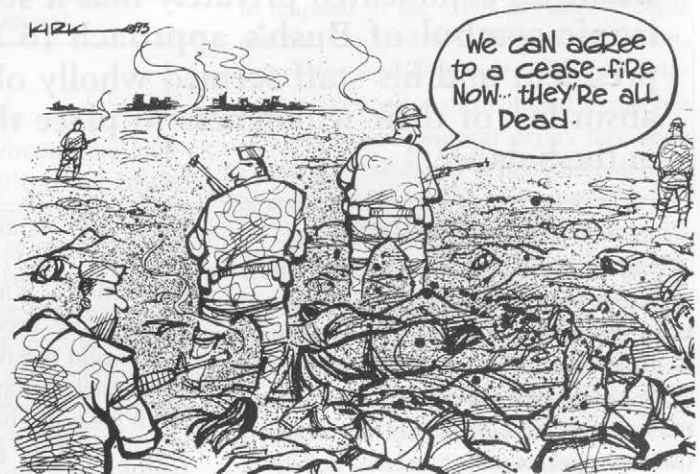
Modern hatreds and Balkan Ghosts. [Kirk Anderson]

Also, the West must make it clear to all Balkan states or would-be-states, that respect for the rights of ethnic minorities is a prerequisite to becoming incorporated into the European community of nations. Unless Western policy makers develop a normative system of order and legality in the Balkans and Eastern Europe—and quickly—social disarray and brutal ethnic conflict will continue to fill the vacuum left by the collapse of communism. ●