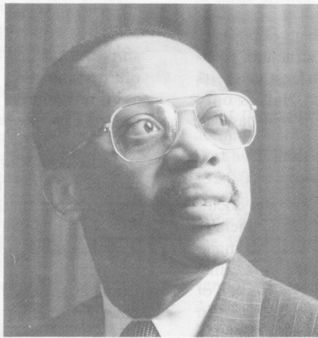
Jean-Bertrand Aristide: democratically elected then overthrown.

When the Zinglando began broadcasting strongly anti-American rhetoric and challenging American motives, the U.S. became increasingly wary of direct involvement. For example, the navy vessel Holland County turned back on its assignment to help professionalize the Haitian military. Recently, Secretary