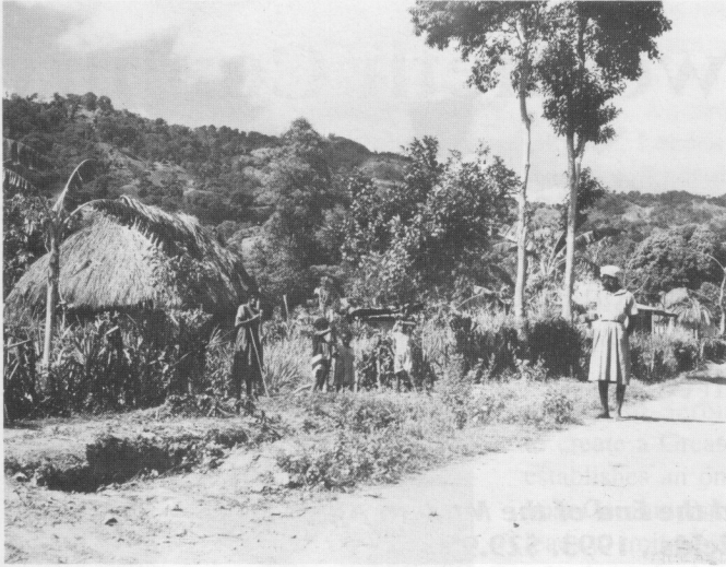
A family home, typical of life in rural Haiti (1970).

of State Warren Christopher has acknowledged that American policy in Haiti has failed, and many are skeptical not only of the Haitian military, but of Aristide's chances for success as well.