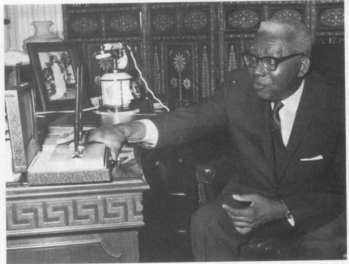
Francois "Papa Doc" Duvalier, self-declared President For Life.

Duvalier's first hurdle was to come to terms with the pivotal role of the military. By organizing loyalists into a paramilitary guard known as the "Tontons Macoute", bolstering the secret police, and later establishing the Leopards, a U.S.-trained counterinsurgency force, Duvalier was able to counterbalance traditional military strength. In the process, however, he further complicated the power structure by playing the military and the Tontons Macoute against one another while keeping both under his control. At the same time, he gained the military's direct support through a combination of carrot and stick. He controlled the appointment of high military officials, granted privileges to army supporters, condoned the military's long-standing control of political terror, and dealt