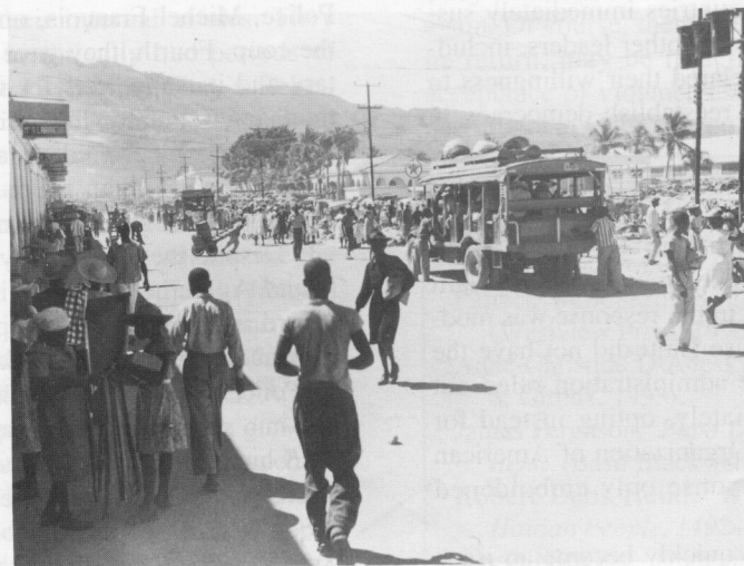
Business as usual: downtown Port-au-Prince during the Duvalier era.

Father Aristide, born in 1954, was the son of an educated and devoutly Roman Catholic Haitian family. He joined the Salesian teaching order and pursued advanced studies in the Dominican Republic, Israel, and Canada. More influenced by radical Liberation Theology than by traditional Catholicism, Aristide was known for citing the Gospel of St. Luke, where Christ is quoted as saying: "And he that has no sword, let him sell his gar-