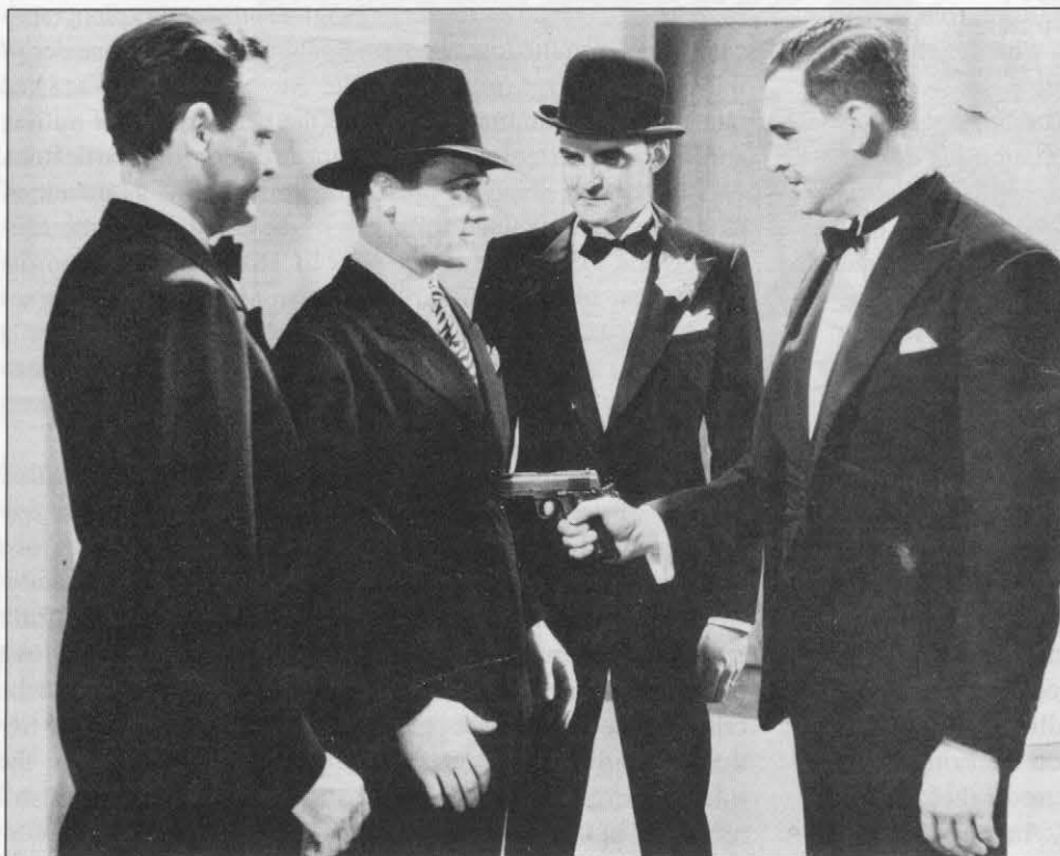
Romanticizing gun culture in the great American gangster movie. [G-Men]

Provisions for an armed citizenry, and particularly state militia, were included in nearly all the constitutions of the original thirteen states. The prevalence of this position was partly born of practical