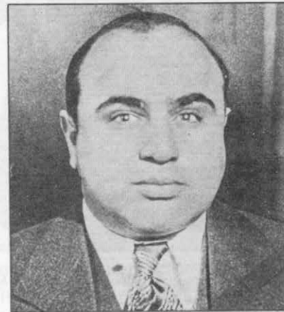
Al Capone: the Prohibition-era rise of organized crime.

To this day, the Court's position has remained unchanged.