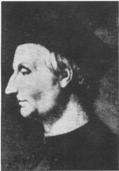
Machiavelli: the necessity of an armed citizenry for a virtuous republic.

One important source of the political beliefs of America's founders was a classical republican philosophy descended