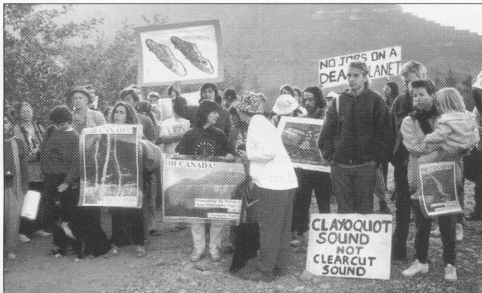
Blockade in Clayoquot Sound: 1,000 arrested, over 800 charged in 1993.

land rain forests. In this complex environment, old growth trees up to 1,500 years old and 18 feet in diameter exist in a biomass (the number of living things per cubic meter) that is the largest of any ecosystem on earth. The delicate balance of life within such a system makes the species who inhabit it completely interdependent; when one part is destroyed, the whole suffers.