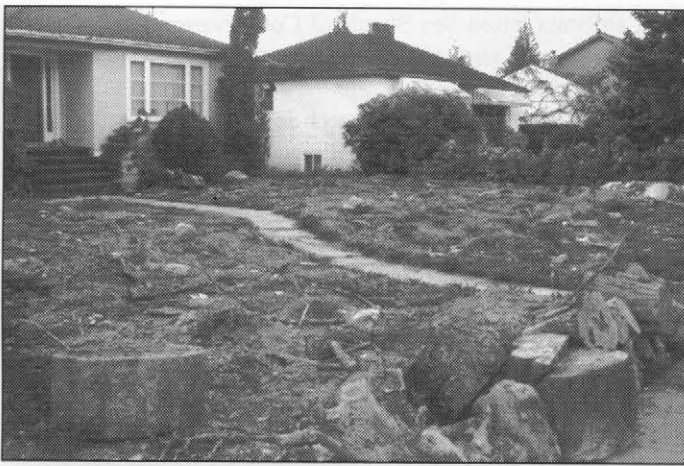
"Clayoquot Sound is in your backyard too!" a Vancouver resident recreates the destruction of the rain forest. [Gloria Loree]

threatened to take court action to forestall logging in Clayoquot Sound until their grievances were addressed. The First Nations certainly had legal precedent on their side.