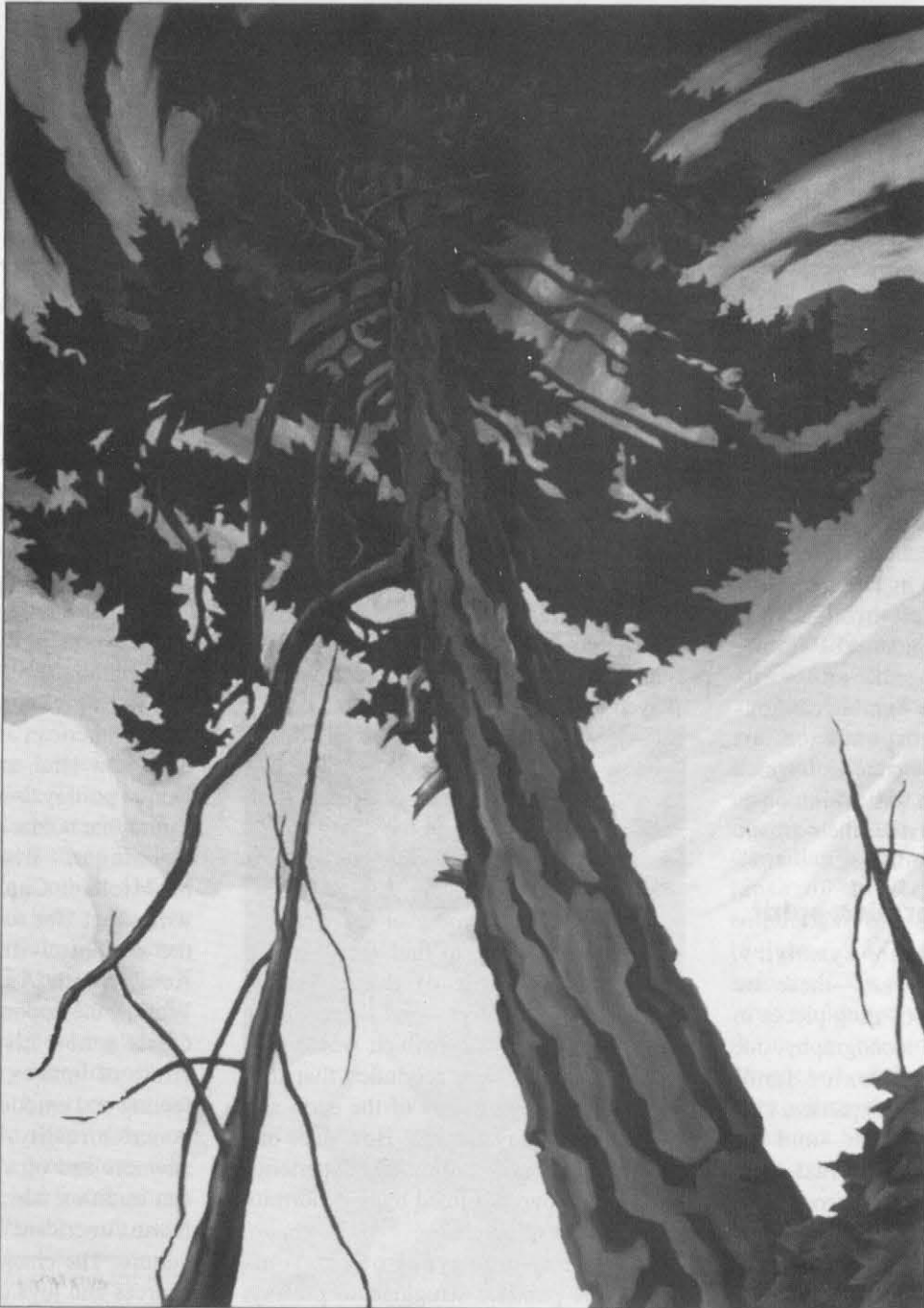
W.P. Weston, Unvanquished , 1933: depicting the towering omnipresence of nature. [The Vancouver Art Gallery Acquisition Fund]

through the cultural centers of Europe and North America, these trends played an important role in shaping the work of artists on the West Coast. Two of these philosophies—Transcendentalism and Theosophy—clearly capture some of the roots of The Informing Spirit's visual message.