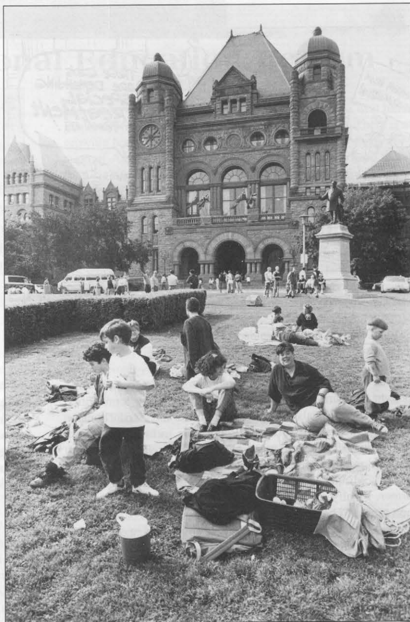
A day in the park: official family picnic sponsored by the Campaign For Equal Families. [Danny Ogilvie]

Wolfson says judges are frequently more willing to make decisions in favor of same-sex rights than representatives with next-election jitters who run for the woods at the first sight of controversial legislation. "Almost certainly, equal marriage rights are going to come through the courts and not through the legislatures. That's because the discrimination is