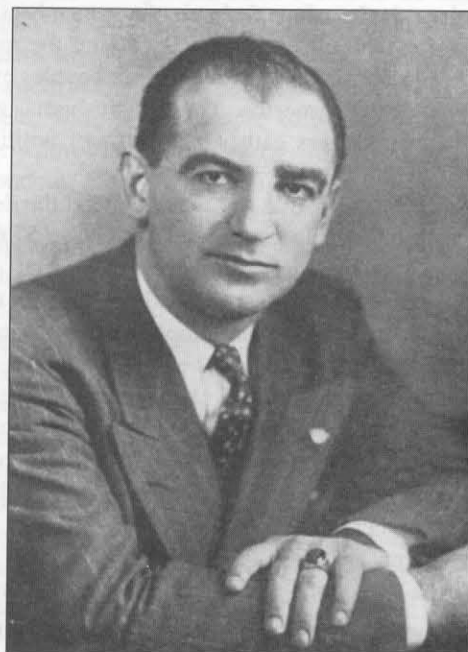
Senator Joseph McCarthy believed homosexuals to be risks to national security.