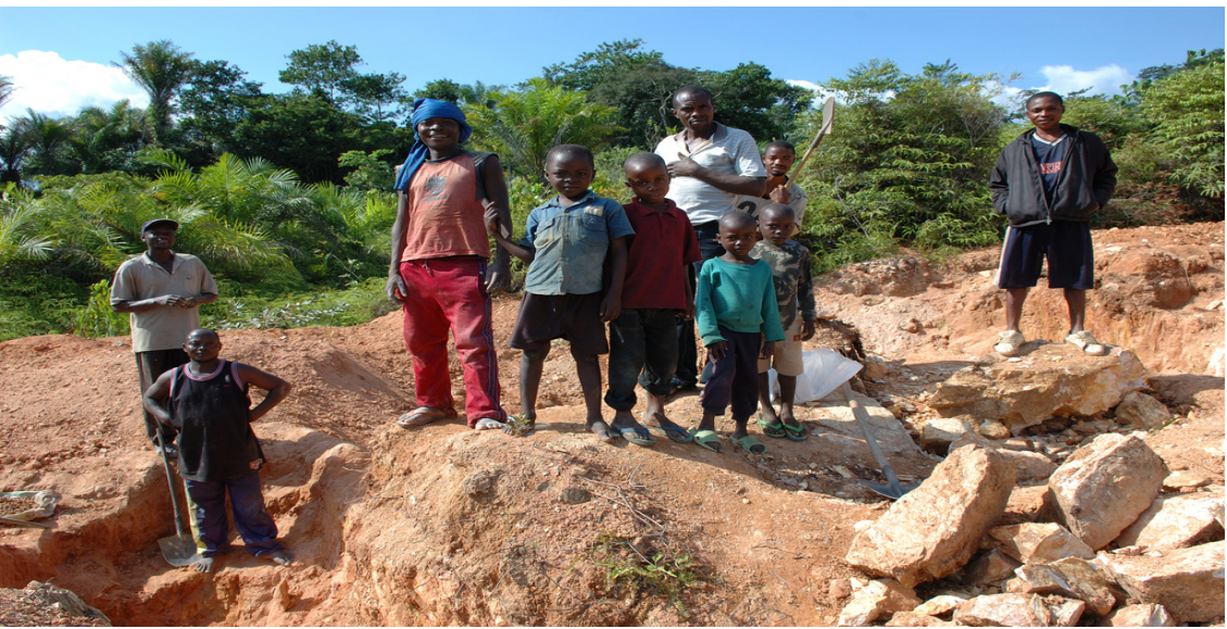
Artisan miners in Congo, including children helping their parents, in the mid-2000s.