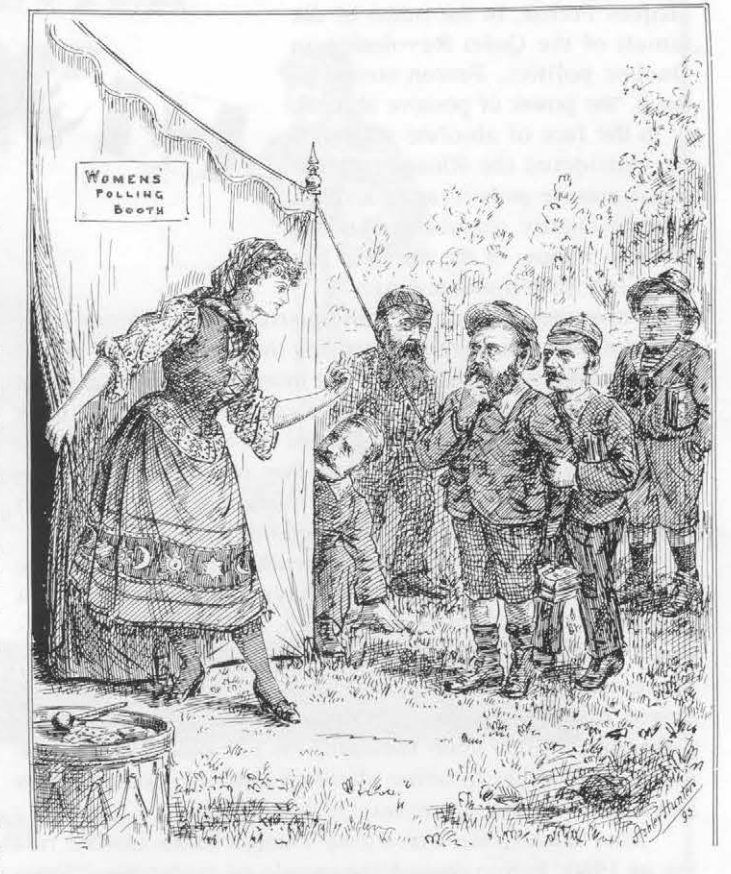
Having their fortunes told: New Zealand's politicians are given a crystal clear view of the future.

The New Zealand passage of female suffrage is a stark reminder that while laws may be changed with a few deft scratches of a pen, it requires generations for attitudes and assumptions to transform.