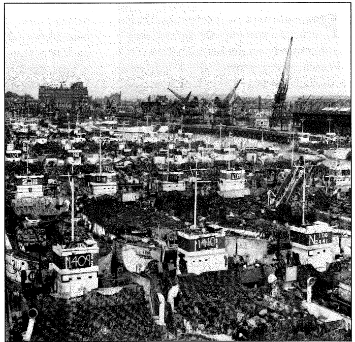
The forces of Operation Overlord massed at Southamton Docks, June 4, 1944.

Eventually, the force consisted of a huge naval fleet of 359 warships, 1,000 mine sweepers, 4,000 landing vessels, 805 merchant vessels and almost 30,000 miscellaneous small craft. More than 11,000 aircraft had been assem-