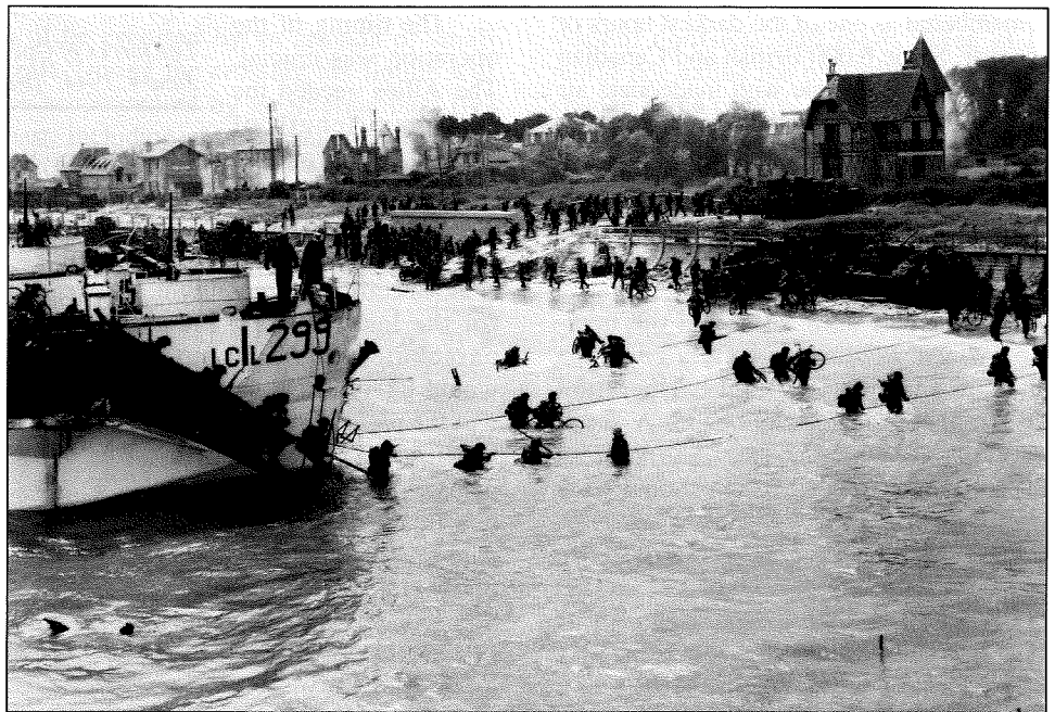
D-Day landings on the beaches of Normandy. Troops of the North Nova Scotian Highlanders going ashore at Bernieres-sur-mer.

Operation Overlord, the invasion of Normandy by Allied troops on D-Day, began the liberation of France and turned the tide of the war in Europe. Fifty years later, as British and French governments host large-scale commemorations of this event, we look back from a world which has yet to learn the lessons of the war it vowed never to forget.