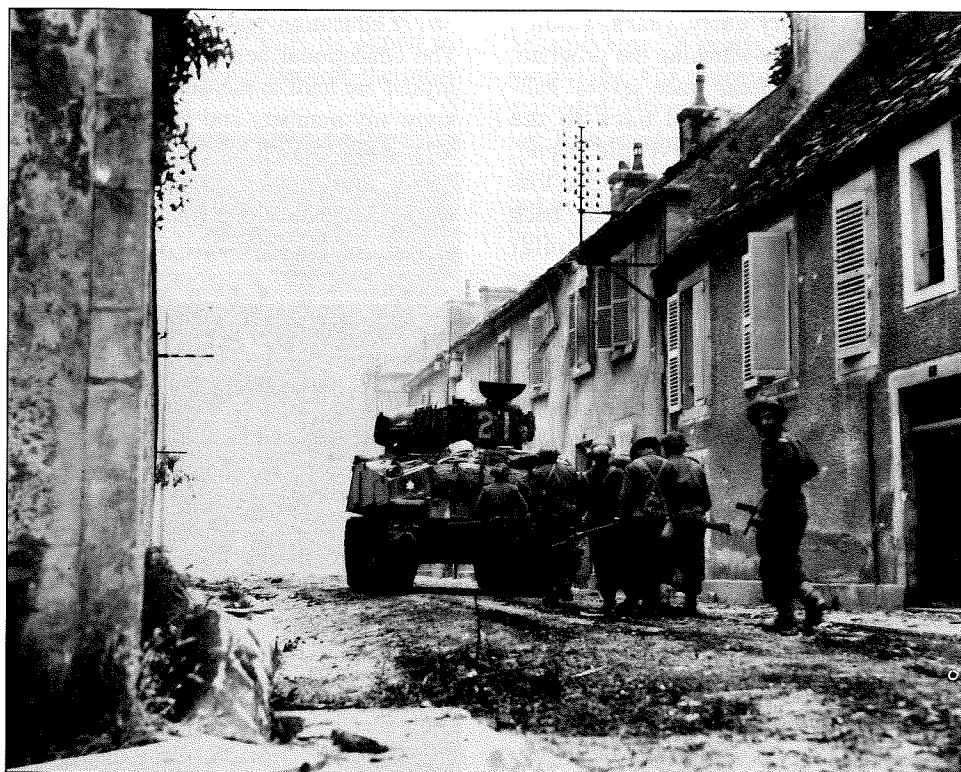
Allied troops move through the French village of Falaise on August 17, 1944.

The events triggered by D-Day constitute an essential part of our history, our culture and our education. For this reason, people ought to be reminded of them time and time again—not only to remember the dead, but to study the mistakes of the past in the hopes that generations to come will have nothing new to commemorate. ●