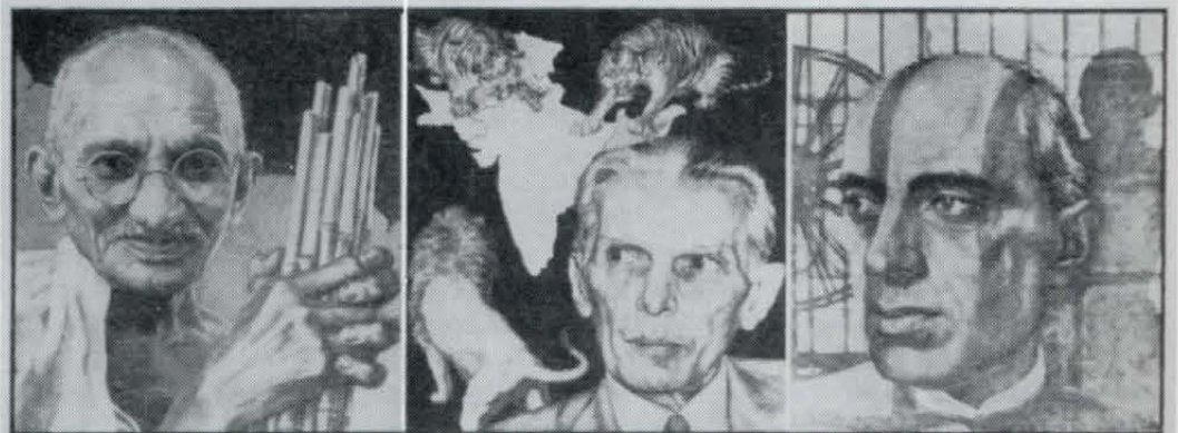
Mohandes K. Gandhi, Mohammed Ali Jinnah, and Jawaharlal Nehru.

I will concentrate here on the most disagreeable of contemporary developments: the rising tension between Hindus and Muslims, as exposed by the destruction of a sixteenth century mosque at Ayodhya (a city in the northern province of Uttar Pradesh) and