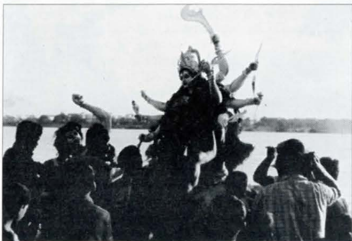
Durga Puja—Hindu Festival, Calcutta

Akbar (1556-1605), who, more than Babur and Homayun before him, established the lasting structure of the empire, did so by allying himself with the Hindu Rajput warriors in Rajasthan and giving Hindus positions in his government. Akbar tried to find a common ground between the peoples. He devised a composite religious cult which, while it centred on himself—consolidating the emperor’s status as something akin to a divine right—also detached Mughal rule from any strict Muslim orientation. Such moves were to insure that the Mughal empire, with