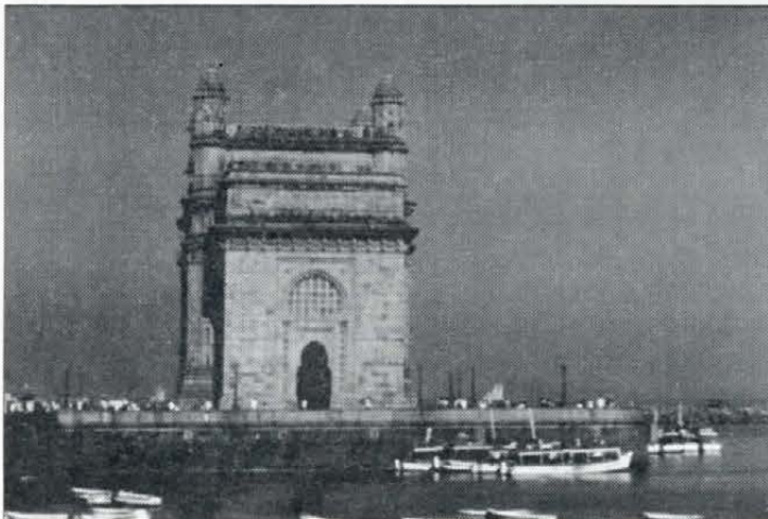
Gateway to Bombay in quieter times.

It is exceedingly difficult to anticipate anything when speaking