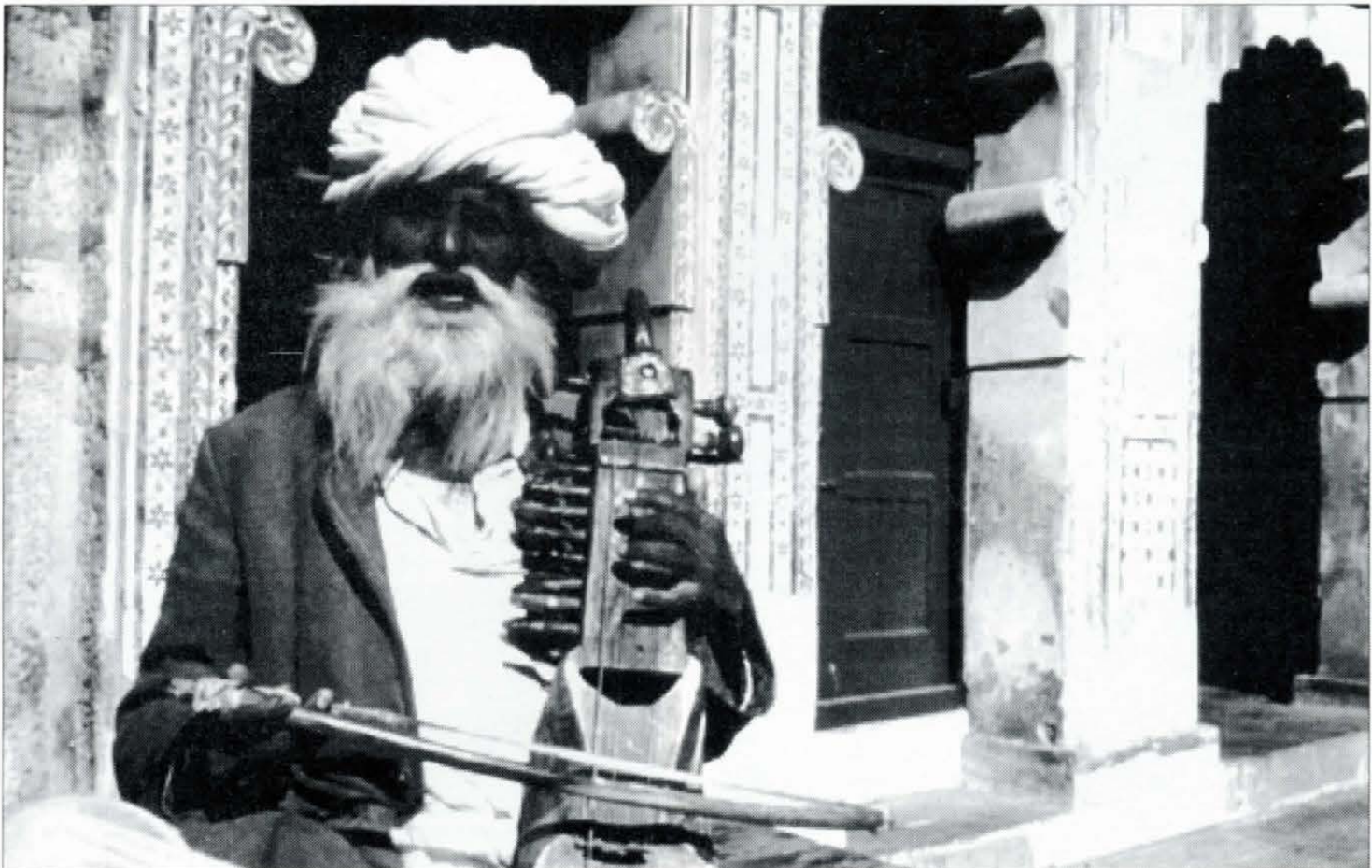
Fiddling while Ayodhya burned.

When analyzed closely, the idea of making India a Hindu state seems unfeasible. Perhaps not even the BJP can ultimately believe in it. While the Muslim population amounts to only around eleven per cent of the population relatively speaking, the real numbers of Muslims are formidable. It would be impossible to suppress such an enormous community or be rid of them. Further, because out of all the states only Kashmir (a different case