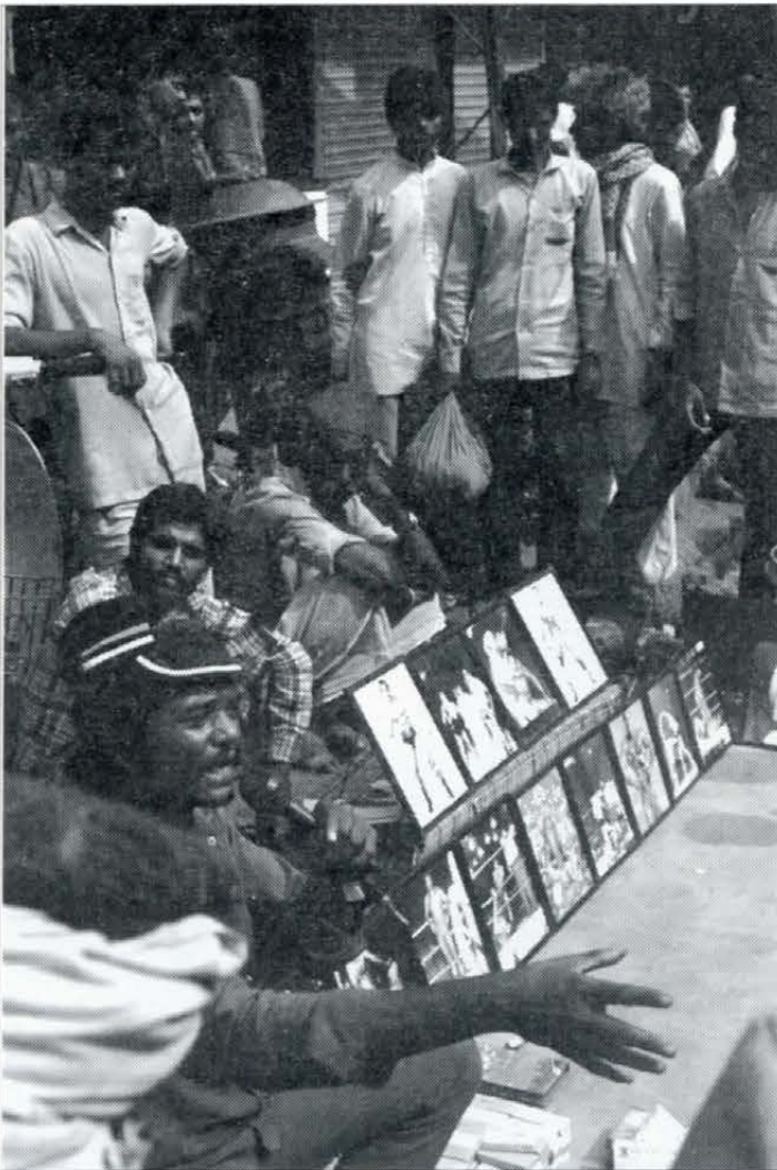
Selling dreams on the street.

The grievances voiced by the BJP have had to do primarily with certain legal concessions to Muslims guaranteed in the constitution. In radically overhauling Hindu personal law to conform with his western liberal concept of the rights of the individual, Nehru not only abolished caste restrictions but managed to pass less popular bills certifying the rights of women. These laws, however, are not binding on Muslims. Thus, a Hindu can be taken to court for polygamy while a Muslim cannot. Equally, the liberal terms for divorce apply only to Hindu marriages. Not so much sanctioning a bias against Hindu men as against Muslim women, these differences are nonetheless brought up constantly as unfair to the majority. A call for their correction has been the BJP's central plank.