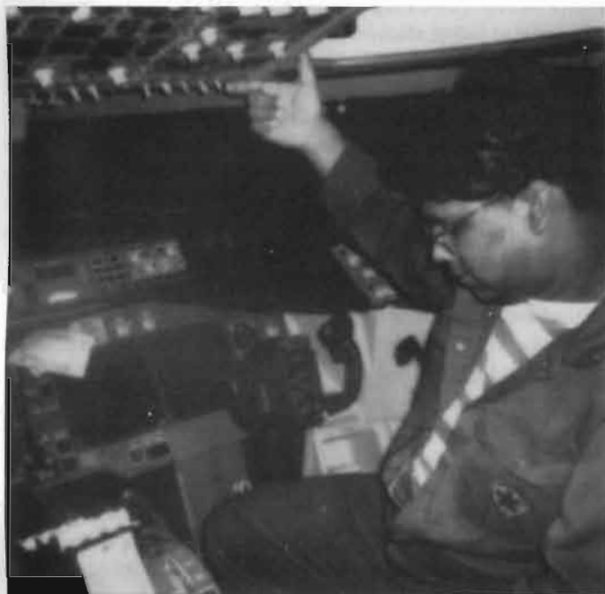
Learning skills for the next century.

One significant departure from “remedialization” came in the 1950s in response to a report on vocational education enrollments and the 1957 launch of Sputnik by the U.S.S.R. These developments fueled the National Education Act of 1958 to provide federal funds for a high-level math and science curriculum. Unlike 1917, the response was not a call for better worker training but for the cultivation of intellectuals: scientists, mathematicians, and engineers.