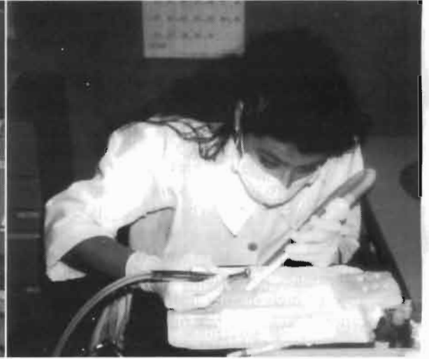
Metro Toronto School Board