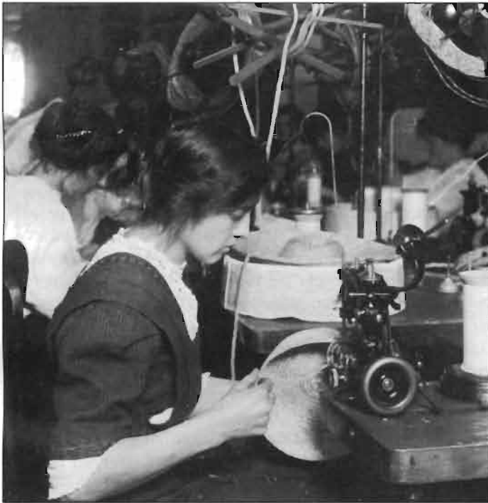
Learning the skills of the new industrial economy, c. 1910.

Critics describe existing "vocational" programs as "warehouses" for students who perform poorly in academic subjects and which train these students on outdated equipment for disappearing, low-skills jobs. They argue that students who are considered bored or low-achieving in traditional academic classes opt for or are placed in some kind of vocational education program. Such is said to be particularly true for black and Latino teenagers, as well as low income students, who have "chosen" vocational education options in greater numbers than other social groups. Generally, "voc. ed." students receive little guidance or high quality instruction. Upon completion of their vocational program, they find it difficult to secure enrollment in institutions of higher education or to find work with possibilities for advancement.