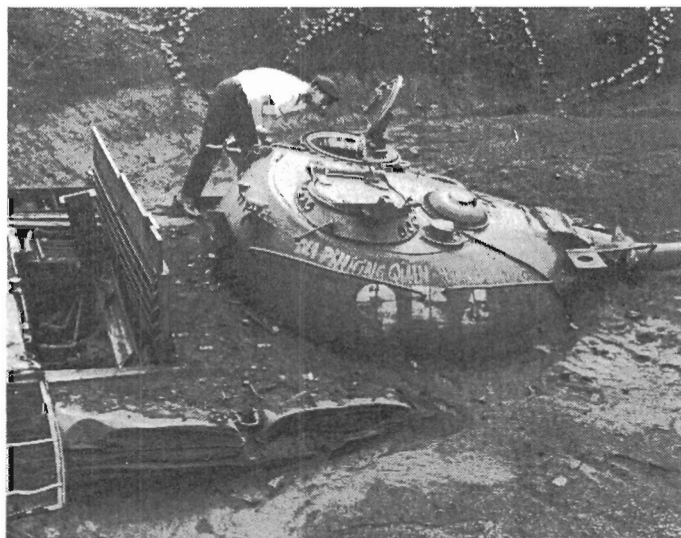
VIETNAM: Supervising and observing.

The ICCs were divided into teams of observers, with representatives from each of the three participating nations. The role of these observers was to investigate any reported violations of the Geneva agreements. Canada began its membership on the ICC intending to be as impartial as the situation would allow. It soon became evident, however, that the Poles were examining every situation from a partisan, Cold War perspective. To