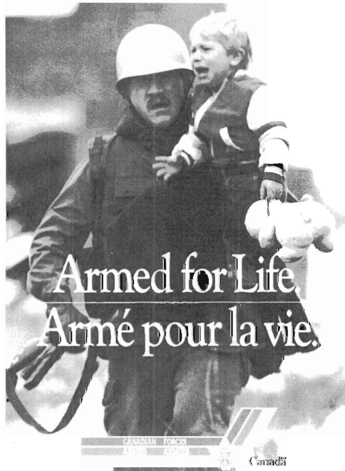
Canadian Armed Forces recruiting poster, 1993. [Canadian Armed Forces]

For nearly 30 years, the United Nations Force in Cyprus (UNFICYP) has attempted to preserve peace between the