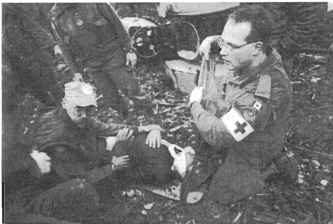
BOSNIA: Tending to the wounded.

The Canadian delegation reports to the Canadian government and the Canadian government only; it is for the Canadian government to decide in the case of these reports...what use is to be made of them in the course of normal diplomatic exchanges with other countries.