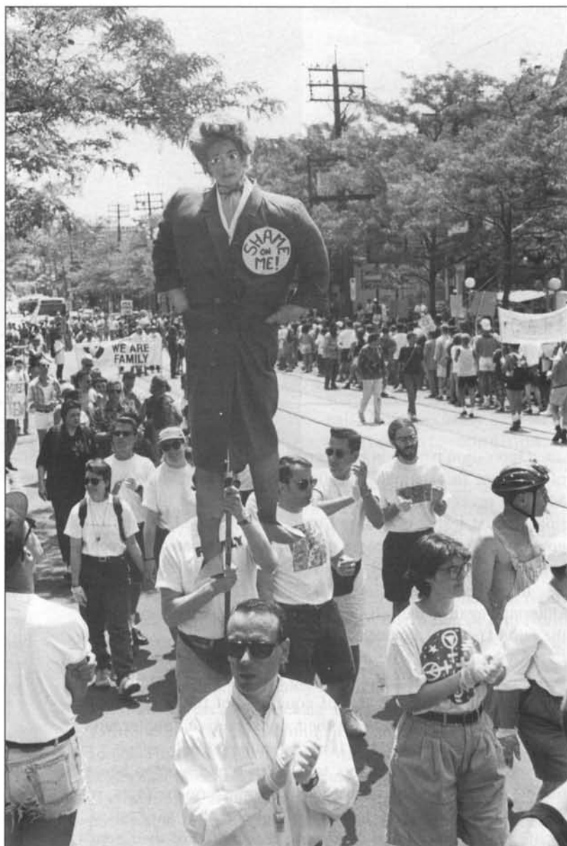
Bill 167 defeated: demonstrators carry an effigy of Lyn McLeod who refused to support the legislation.