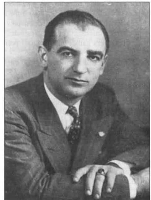
Senator Joseph McCarthy believed homosexuals to be risks to national security.