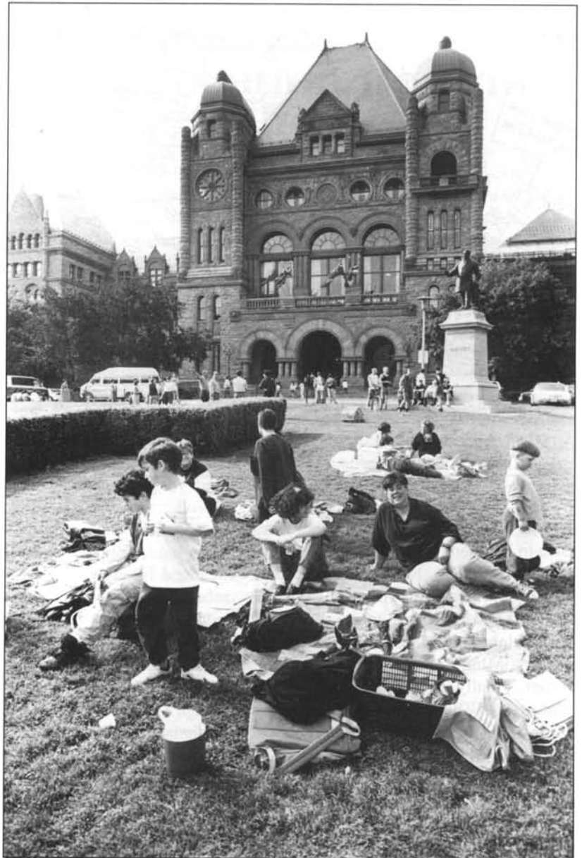
A day in the park: official family picnic sponsored by the Campaign For Equal Families. [Danny Ogilvie]

Wolfson says judges are frequently more willing to make decisions in favor of same-sex rights than representatives with next-election jitters who run for the woods at the first sight of controversial legislation. "Almost certainly, equal marriage rights are going to come through the courts and not through the legislatures. That's because the discrimination is