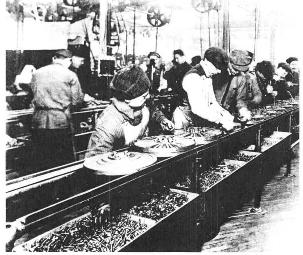
Pass it on: employees at Ford's Highland Park (Michigan) plant on the first automotive component assembly line (1913).

Perhaps the biggest winner in the "second industrial revolution" was the advertising industry. Money and time could not guarantee the level of consumption that American manufac-