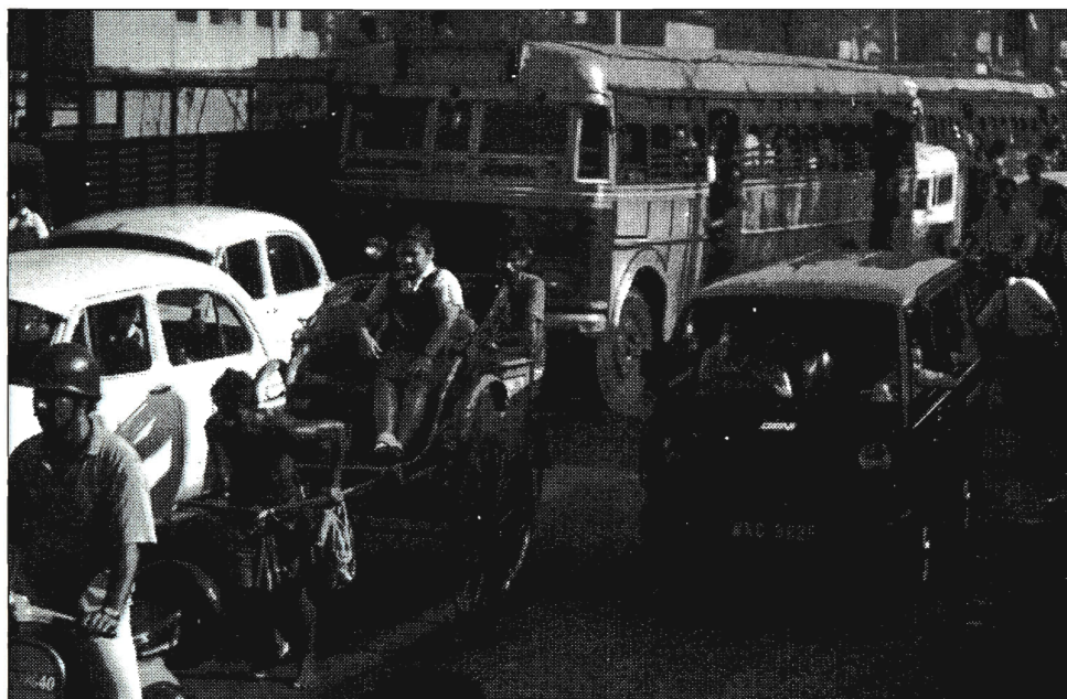
A rickshaw wallah struggles to keep his place amidst heavy early morning traffic.

The vast supply of rickshaw wallahs is consistently fed by an overabundance of poor who eagerly accept this harsh