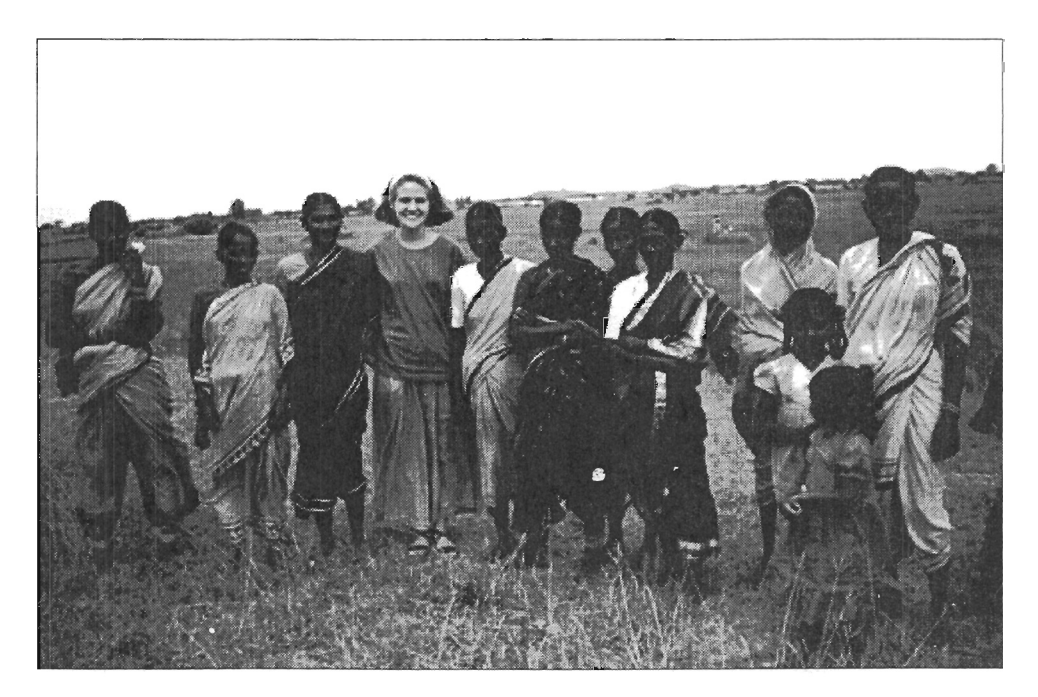
The author with some Joginis and their children. Nizamabad district, India. October, 1992

If economic vulnerability does not first succeed in prompting a family to dedicate their daughter into concubinage, then, in small temple villages, religious superstition often plays a key role in the decision making process. When someone in a village community falls ill, it is not uncommon for a landlord to circulate the