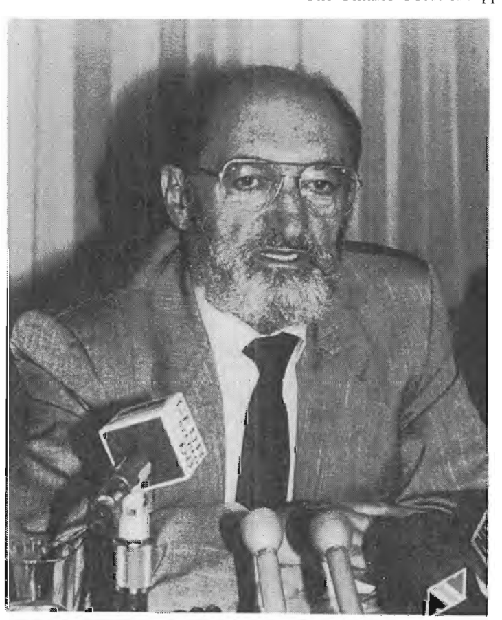
Morgentaler speaks out.

Within the year, Nova Scotia's Medical Services Act was struck down by a provincial court judge, and Morgentaler was acquitted of all charges. The court found that laws concerning abortion fall under the jurisdiction of the federal government, not a provincial government. Frustrated by the judge's decision, the government of Nova Scotia appealed to the province's Supreme Court. In July 1991, the latter upheld the lower court's decision—a further victory for Morgentaler. Still not satisfied, the Nova Scotia government then decided to appeal to the Supreme Court of Canada. The appeal was heard in November, 1991 and remains unresolved. A decision is not expected until the end of