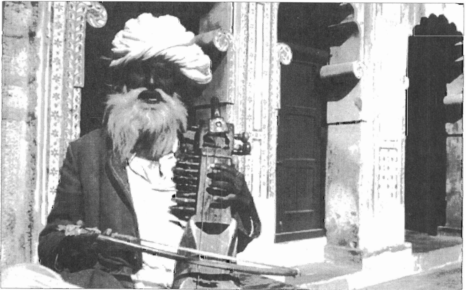
Fiddling while Ayodhya burned.

When analyzed closely, the idea of making India a Hindu state seems unfeasible. Perhaps not even the BJP can ultimately believe in it. While the Muslim population amounts to only around eleven per cent of the population relatively speaking, the real numbers of Muslims are formidable. It would be impossible to suppress such an enormous community or be rid of them. Further, because out of all the states only Kashmir (a different case