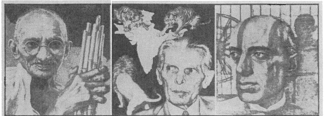
Mohandes K. Gandhi, Mohammed Ali Jinnah, and Jawaharlal Nehru.

I will concentrate here on the most disagreeable of contemporary developments: the rising tension between Hindus and Muslims, as exposed by the destruction of a sixteenth century mosque at Ayodhya (a city in the northern province of Uttar Pradesh) and