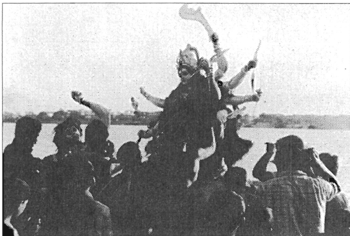
Durga Puja—Hindu Festival, Calcutta

Akbar (1556-1605), who, more than Babur and Homayun before him, established the lasting structure of the empire, did so by allying himself with the Hindu Rajput warriors in Rajasthan and giving Hindus positions in his government. Akbar tried to find a common ground between the peoples. He devised a composite religious cult which, while it centred on himself—consolidating the emperor’s status as something akin to a divine right—also detached Mughal rule from any strict Muslim orientation. Such moves were to insure that the Mughal empire, with