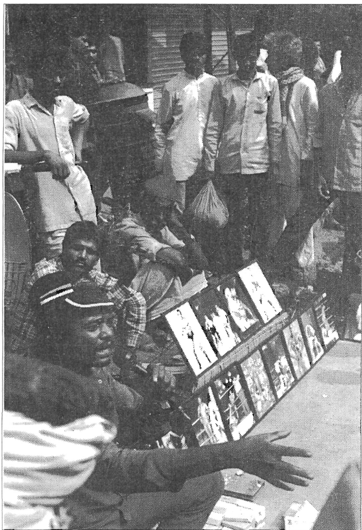
Selling dreams on the street.

The grievances voiced by the BJP have had to do primarily with certain legal concessions to Muslims guaranteed in the constitution. In radically overhauling Hindu personal law to conform with his western liberal concept of the rights of the individual, Nehru not only abolished caste restrictions but managed to pass less popular bills certifying the rights of women. These laws, however, are not binding on Muslims. Thus, a Hindu can be taken to court for polygamy while a Muslim cannot. Equally, the liberal terms for divorce apply only to Hindu marriages. Not so much sanctioning a bias against Hindu men as against Muslim women, these differences are nonetheless brought up constantly as unfair to the majority. A call for their correction has been the BJP's central plank.