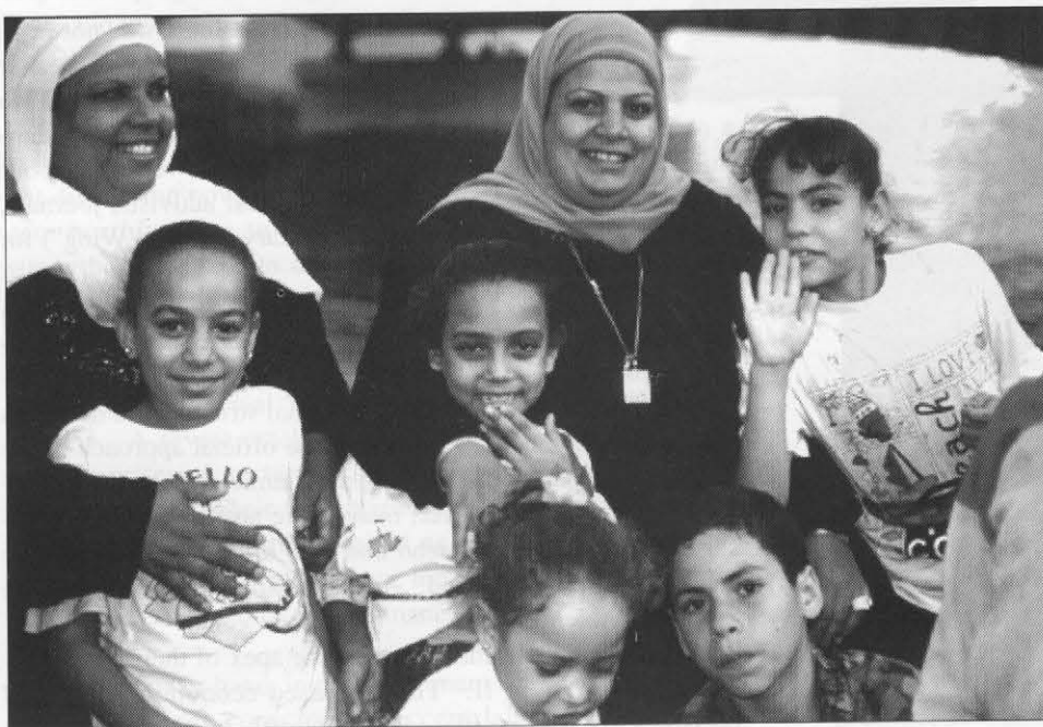
The many faces of fundamentalism

Muslim groups have often taken clearly defined actions to mitigate widespread hardships and bring services and aid to sections of the populace that the ineffectual and cumbersome bureaucracy cannot reach. Through the philanthropic infrastructure of the mosques, they have set up relief organizations,