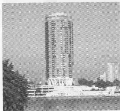
One of the fundamentalists' hated Western hotels, in Cairo

One of the extreme fundamentalist groups that grew up during the Sadat years from the legacy of the Muslim Brothers was al-jihad , or Sacred Combat. It was one of this group's adherents who was the celebrated assassin of Sadat in October, 1981. His words, “I am Khalid al-Islambuli, I have killed Pharaoh, and I do not fear death,” were recorded and broadcast throughout the Islamic world. For many, this sentence represented a relief to finally be rid of Sadat. For others, it was call to battle, the echo of which has yet to fade.