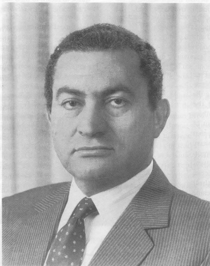
Mohammed Hosni Mubarak: twelve years of emergency rule

It should not be surprising that the universities became loci of Islamic opposition to the regime. The university system at this time (and today as well) left much to be desired. Universities were under-staffed and over-studented. The infras-