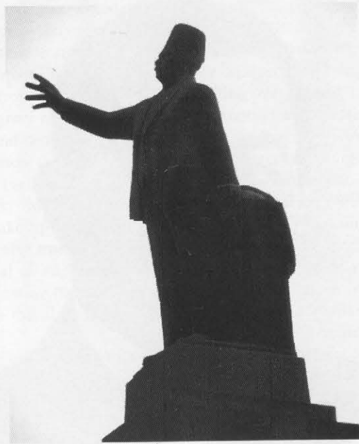
Nasser reaches out to his people

Sadat's new economic orientation was known as the infitah . In retrospect, his policies brought inflation, high prices, American influence, quickly rising foreign debts, a culture of vulgar profiteering, a society that consumed more than it produced, and excluded the poorer classes. Western investors—given privileged status and incentives by the Egyptian government in the hope of attracting large amounts of foreign capital for development—in fact did little to develop the industrial or agricultural infrastructure. Instead, they focussed their