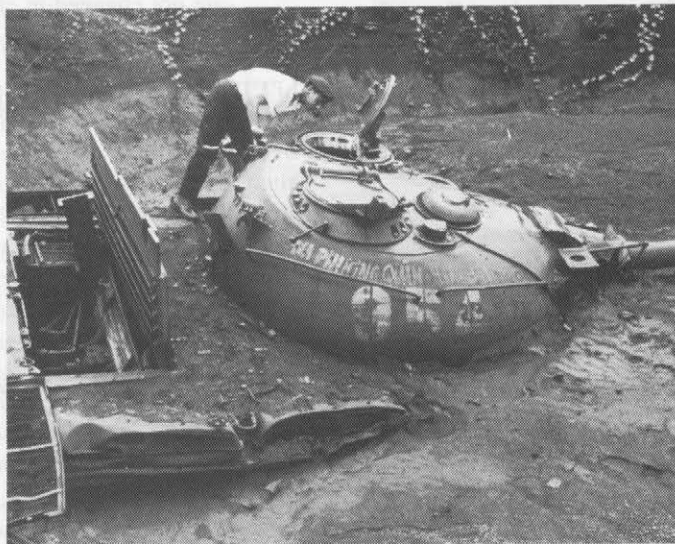
VIETNAM: Supervising and observing.

The ICCs were divided into teams of observers, with representatives from each of the three participating nations. The role of these observers was to investigate any reported violations of the Geneva agreements. Canada began its membership on the ICC intending to be as impartial as the situation would allow. It soon became evident, however, that the Poles were examining every situation from a partisan, Cold War perspective. To