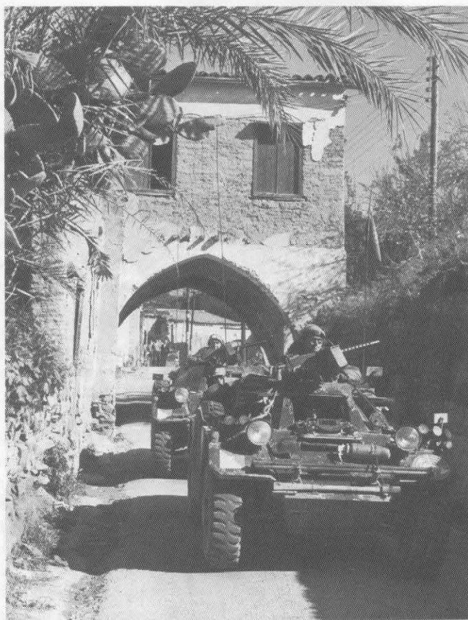
CYPRUS: Tanks roll through Nicosia, patrolling the 'Green Line.'

Minor disputes between Cypriots, as well as the alarmingly high rate of venereal disease among UNFICYP troops, represented the greatest problems facing the peacekeepers. Often the toughest decision facing Canadian troops was whether or