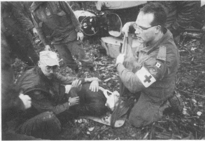
BOSNIA: Tending to the wounded.

The Canadian delegation reports to the Canadian government and the Canadian government only; it is for the Canadian government to decide in the case of these reports...what use is to be made of them in the course of normal diplomatic exchanges with other countries.