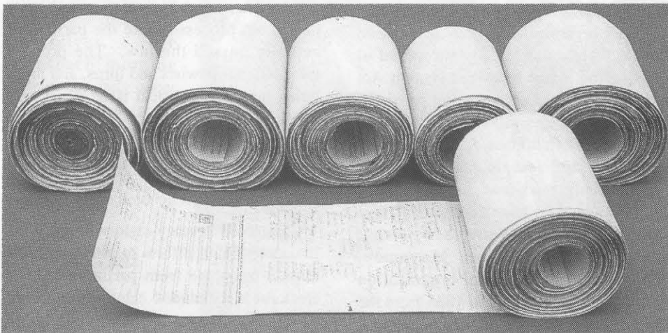
A suffrage petition of 1893. Three hundred yards long and containing signatures of 25% of all women, when unrolled it covered the length of Parliament.

New Zealand women were leading the way internationally in the realms of education and employment. The frontier environment and the recession of the late 19th century coupled to bring increasingly larger numbers of women into the work force. Eighteen ninety-one saw 45,000 women officially classed as wage earners. It was quickly realized that women could compete both competently and completely in the workplace and soon in the universities. In 1877, the first women graduates with a BA passed out of university (one year before London University began admitting women to degree programs). In