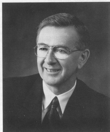
Preston Manning: “balanced federalism” and minimal government.

Though critics are skeptical about the simplicity and lack of sophistication in Reform's proposals, Preston Manning's success in the elections and his growing sup-