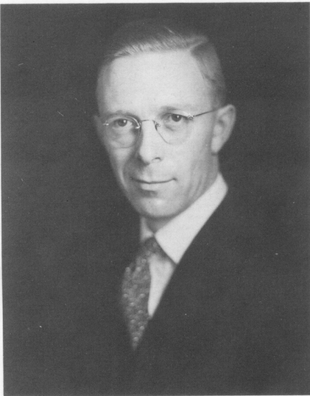
Ernest Manning: sound business principles.

party as a national government in waiting. In the federal arena, Reform has inextricably linked the old populist conservatism with a vision to address the problems of Canadian national identity, and the integration of Canada's West into a new federal structure.