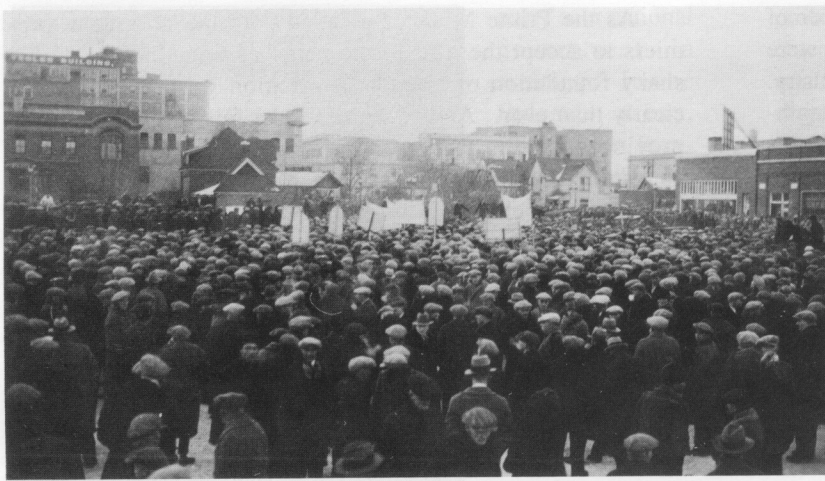
Demanding political action: Hunger March in Edmonton, 1932.

policies are theoretical and ideological, and the party must substantiate its proposals and show that they are workable.