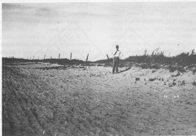
The Great Depression on the Prairies: ravaged crops and abject poverty.

Reform's youth as a political party is a large hurdle Manning will have to overcome. Critics point out that Reform's