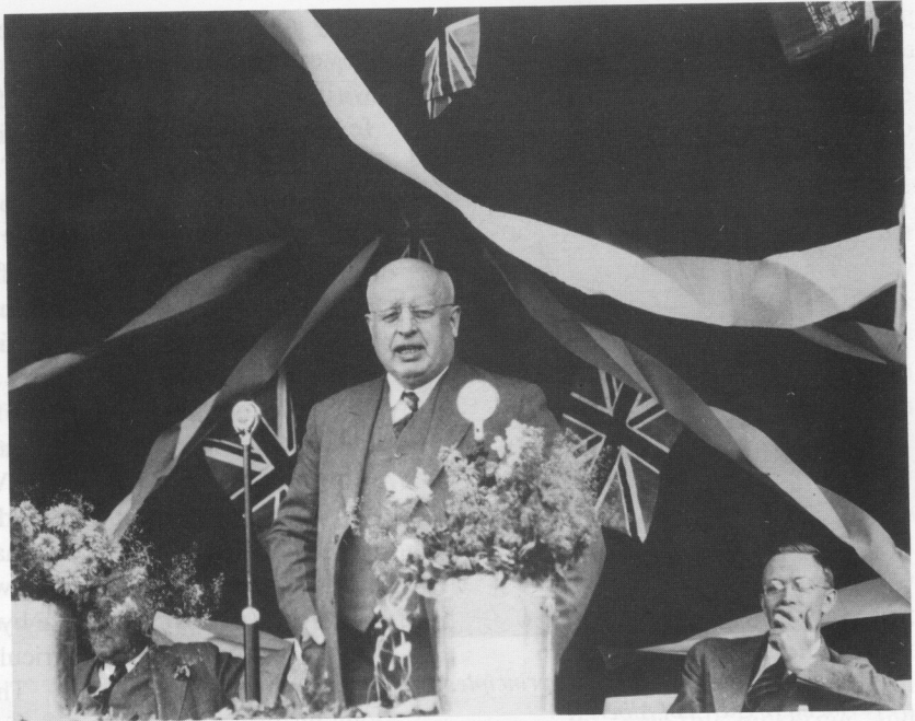
William "Bible Bill" Aberhart: a recipe for "the abolition of poverty in the midst of potential plenty."

Though Douglas' theories were the result of years of study to understand how to measure the credit of a nation, Aberhart popularized Social Credit based only on Douglas' notions of Basic Dividend and Just Price. Basic Dividend was a set sum in credit which was to be distributed to every citizen of Alberta, in order to guarantee life's necessities. Just Price was a method of reducing prices in order to increase consumption to the level of production. Only when these two were equal would the total sale of goods cover the total cost of production.