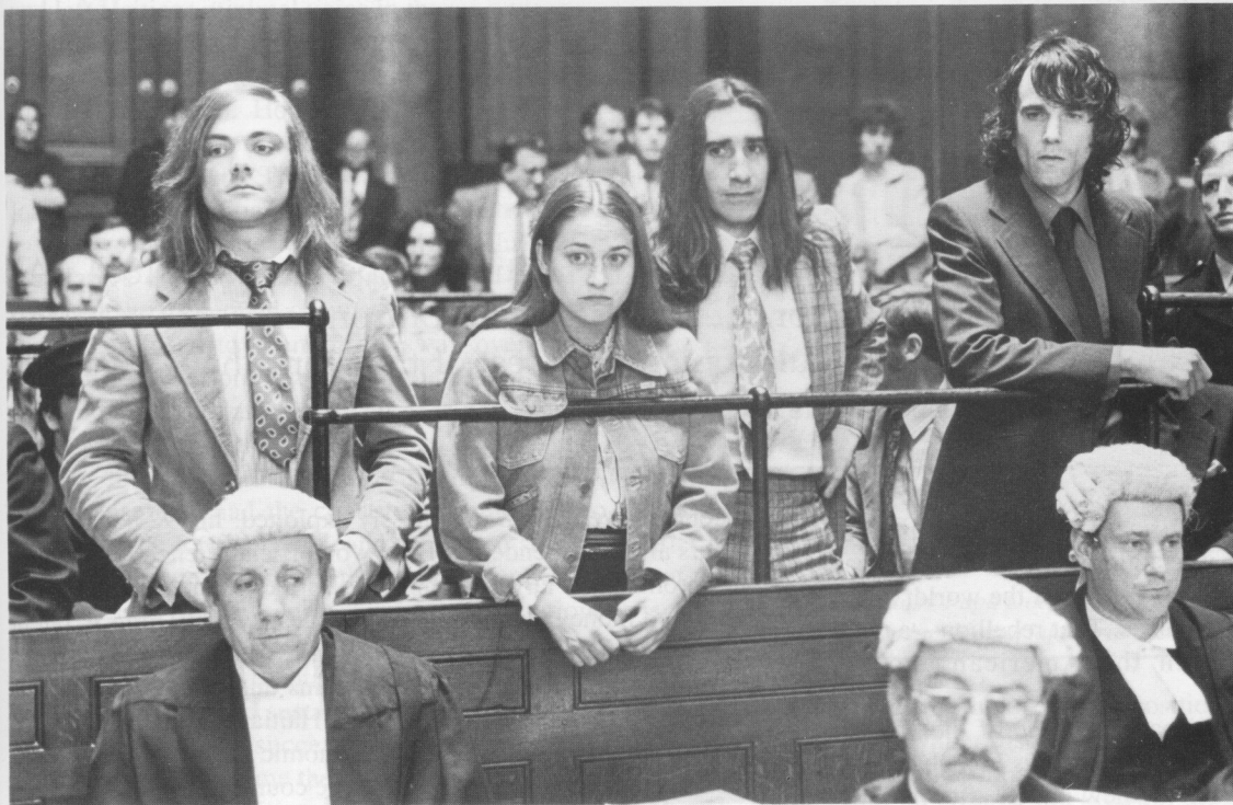
In The Name Of The Father —a cinematic portrayal of the Guildford Four: wrongfully imprisoned for a horrifying crime.

injured, the Iron Lady vowed that "all attempts to destroy democracy by terrorism will fail."