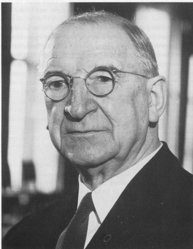
Irish Nationalist Eamon de Valera: armed insurrection and politics intertwined.

By 1918, Irish Nationalists had united under the banner of the recently formed political party, Sinn Fein, to seek complete independence from Britain. Seventy-three Sinn Fein Irish MPs were elected in December, 1918, who then boycotted the London Parliament and instead created the Assembly of Ireland—the Dail Eireann—in Dublin in 1919. Eamon de Valera, the only surviving commander of the Easter Rising who had spent the previous few years in jail, escaped to become president of the new, illegal and unrecognized "Republic". In de Valera, Republican aspirations found a leader with political aptitude and strong ties to rebel fighters. The increased pressure from Irish demands, and the continued refusal of the British government to recognize Sinn Fein's Dail, set in motion two years of