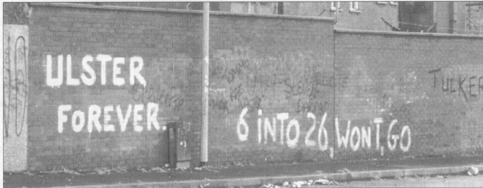
Territorial passions: Loyalist graffiti in Belfast.

Thousands of Irishmen, both Catholic and Protestant, joined the British war effort in the fall of 1914. Left behind were radical Irish Nationalists who saw any attempt to help Britain as counterproductive to their cause. On Easter Monday, 1916, a