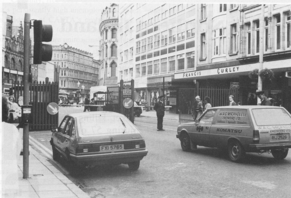
Urban war zone: motorists must pass through a checkpoint to enter central Belfast.

The recent December accord, reached in such a turbulent climate, underlines two important features of Irish history. First, it shows the degree to which terrorism and politics are inextricably connected. Political change invariably results in violence, which in turn forces politicians to act. Second, reactions to the agreement highlight the “zero-sum” nature of negotiations about Northern Ireland: all parties involved consider that concessions granted to one