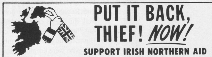
Publicizing the Republican cause internationally.