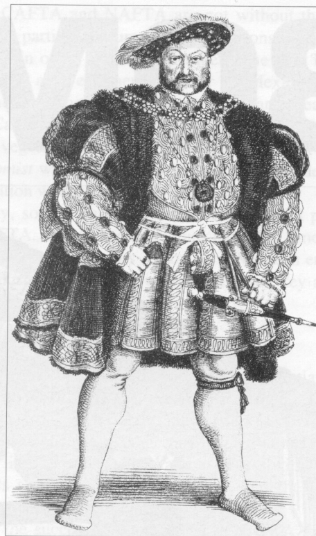
England's Henry VIII proclaimed himself King of Ireland in 1541.

The ultra-Republican IRA seeks a reunited, Catholic Ireland and has chosen to wage a campaign of violence towards that end. Though this dream is shared by the Irish Catholics living in Northern Ireland, the IRA’s terrorism and murdering of innocents draws condemnation from the vast majority of its