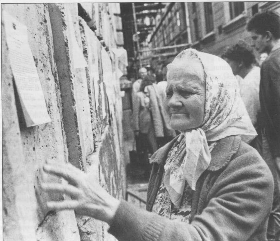
At long last: a Latvian woman reads the Declaration of Independence, August, 1991.

Lithuania developed as a separate unit from its Baltic neighbors and merged with Poland at the end of the fourteenth century. Over time, it became a junior partner in the political union as Polish power increased. Eventually, Lithuanians were