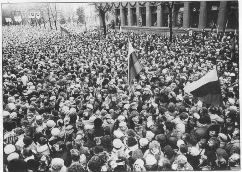
Lithuanians take to the street: a more confrontational agenda for independence. [Draugas]

In Latvia, residents that entered Latvian territory after the Soviet occupation are not citizens. The law on naturalization of