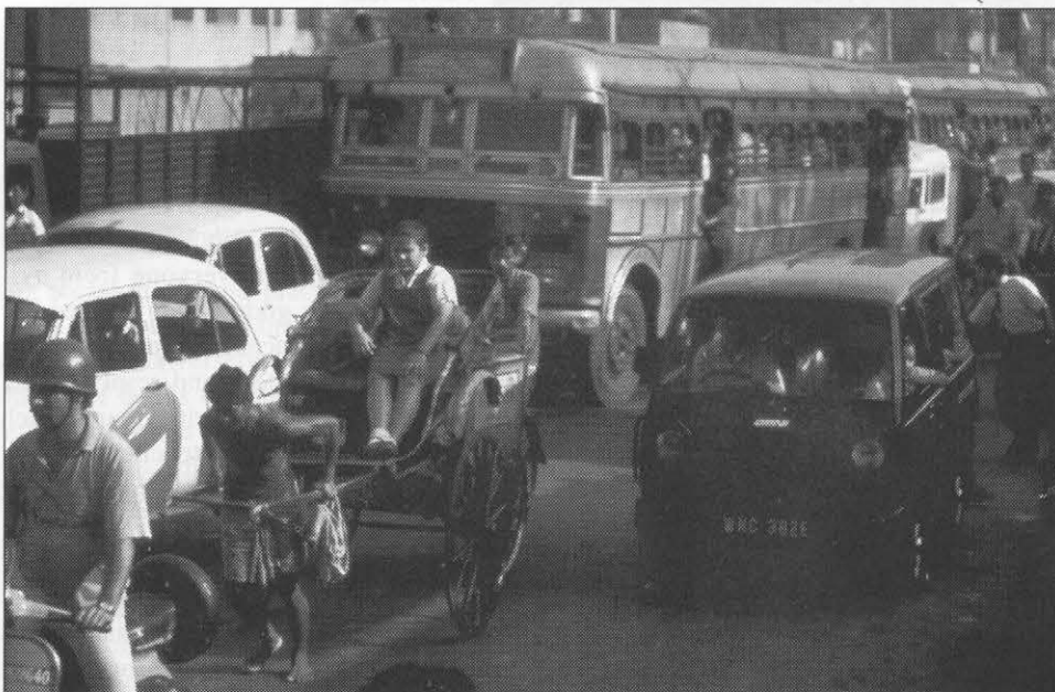
A rickshaw wallah struggles to keep his place amidst heavy early morning traffic.

The vast supply of rickshaw wallahs is consistently fed by an overabundance of poor who eagerly accept this harsh